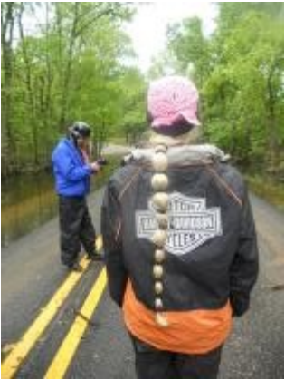
Biker Babe took 11 yrs to grow this long hair