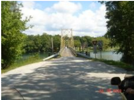
This is the bridge when it is NOT under water