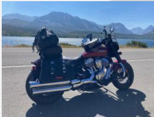
Before: Nice Clean Bike