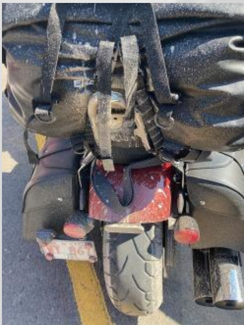
Dirty Road Leads to Dirty Bike