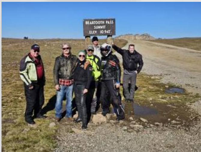
Beartooth Pass Elevation 10,947 ft