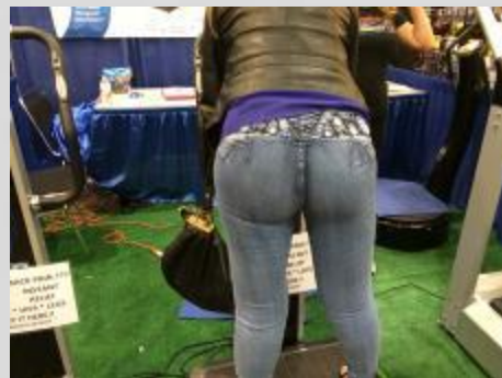
This gal was using the "shake it" exercise machine