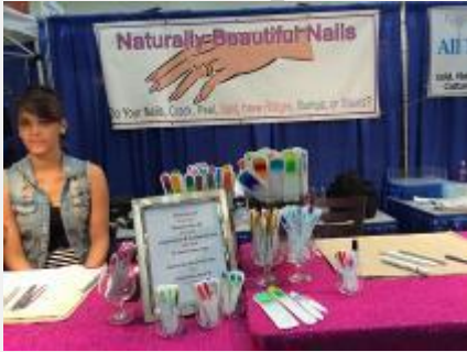
Nails & Lipstick