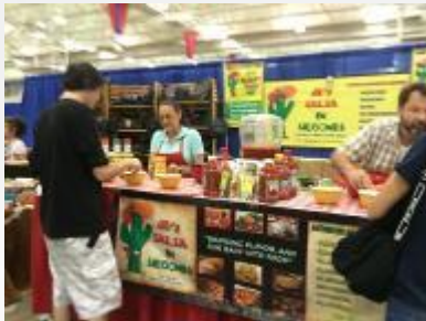
Salsa and Fudge