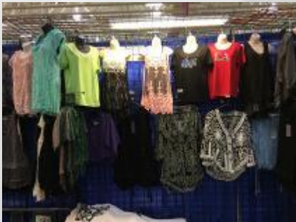
Shirts & Flags