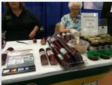
WI sausage & Kitchen Craft