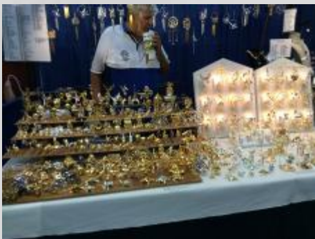
You needed sunglasses to look at this vendor