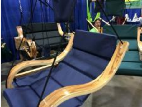
Lounging & Exercise equipment & Bling