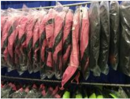
Jackets & ladies bags